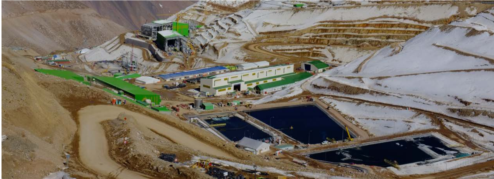
Facilities whole view: SX-EW plant, track shop, concentrator