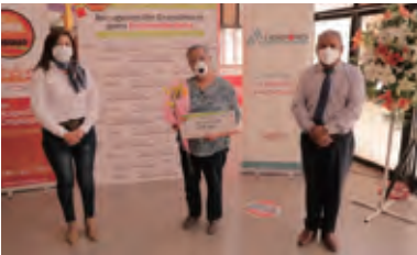
Support for entrepreneurs in collaboration with Copiapó City Hall

SCM Minera Lumina Copper Chile, which operates the Caserones copper mine, collaborated with the Copiapó municipality in October 2020 to provide support to small business owners in the region. More than 80 small business owners received support through the program, which is an economic assistance program aimed at revitalizing the local economy that has been paralyzed by the spread of COVID-19. The company will continue to provide support in helping the people of the community return to their regular lives and to develop the region further.