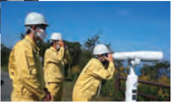
Interns look through a telescope during a chimney tour

SCM Minera Lumina Copper Chile, which operates the Caserones copper mine, collaborated with the Copiapó municipality in October 2020 to provide support to small business owners in the region. More than 80 small business owners received support through the program, which is an economic assistance program aimed at revitalizing the local economy that has been paralyzed by the spread of COVID-19. The company will continue to provide support in helping the people of the community return to their regular lives and to develop the region further.