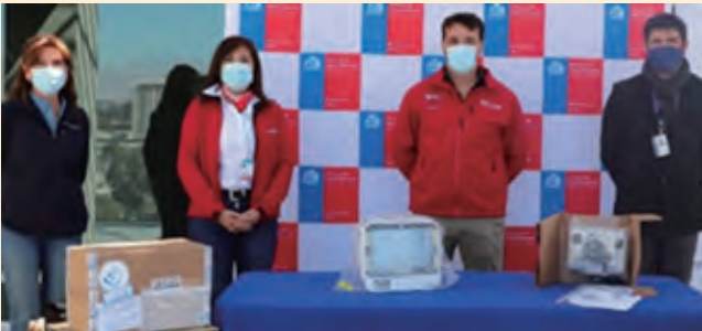
Donation of goods to the Atacama Health Department